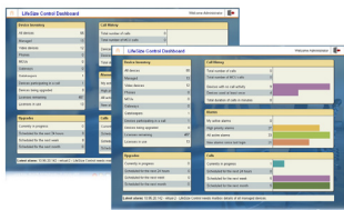
Management and Control

LifeSize offers solutions for live and on-demand streaming and recording and for infrastructure to meet your business needs. More effective communications, better security, greater flexibility and scalability.