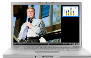
HD Streaming, Recording, Auto-publishing Appliance